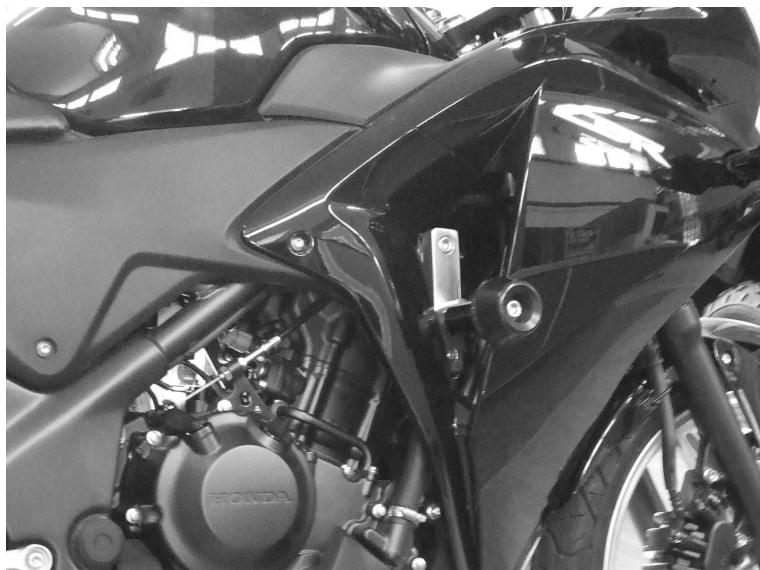
Assembly position (both sides)

Year of production: '11- Product code: 10123