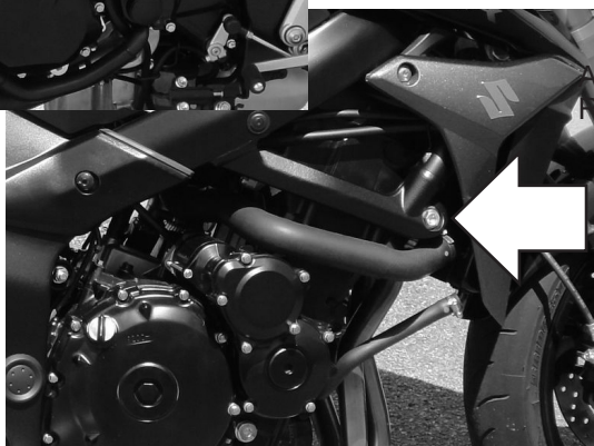
Assembly position / Right side