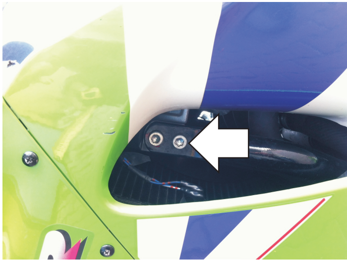
Assembly position (right side)